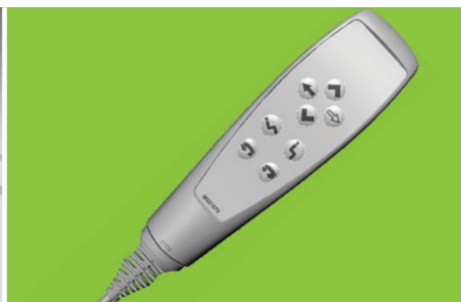
8-button convenient handset